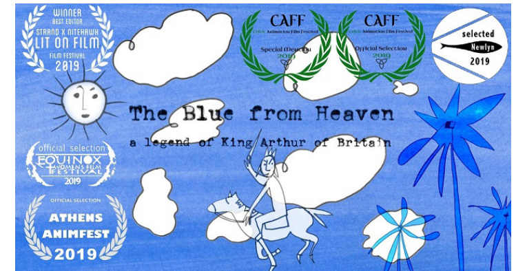
Fig.1 Poster for the animated film

The Blue from Heaven premiered at the Athens Animfest in March 2019 and won an award in 2020.