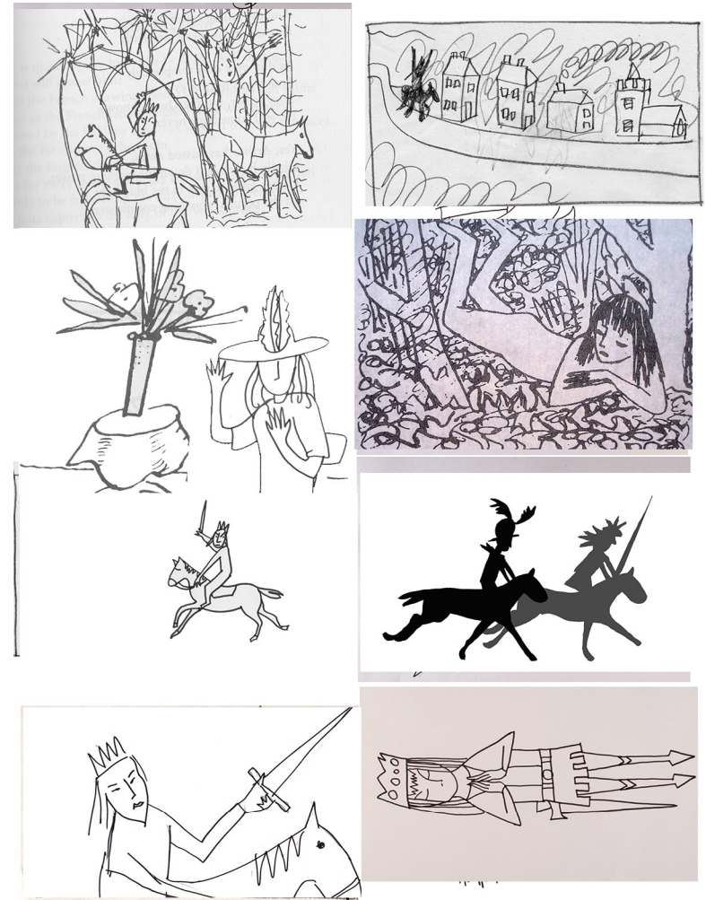
Fig.5 Draft Shot Compositions 2