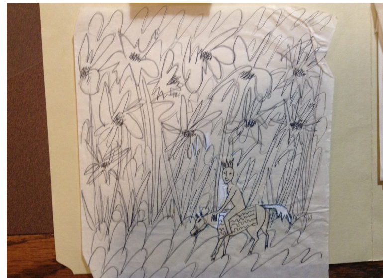
Fig.3 Stevie Smith unpublished drawing