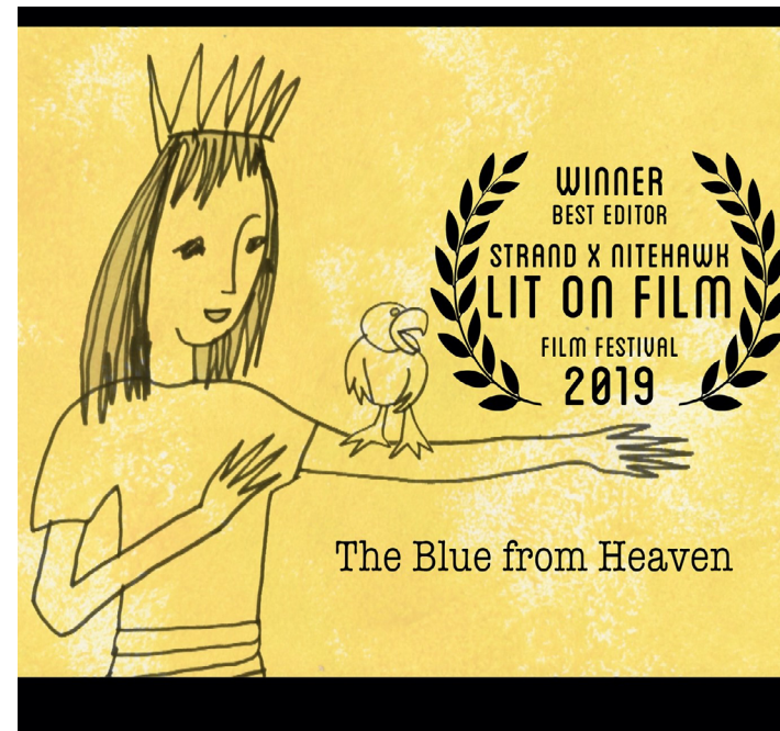
Fig.8 Winner's Laurels Strand X Nitehawk Lit on Film Festival 2019