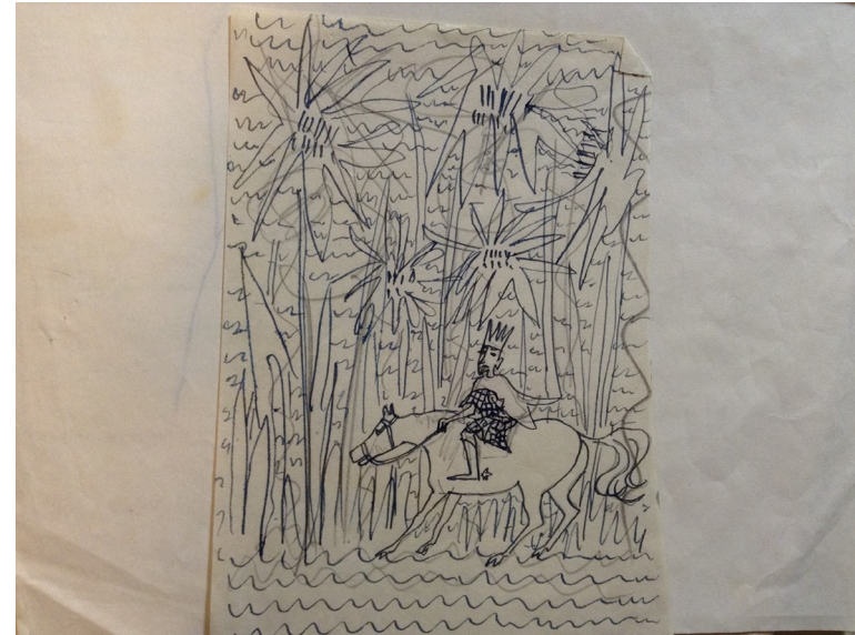
Fig.2 Stevie Smith unpublished drawing of King Arthur