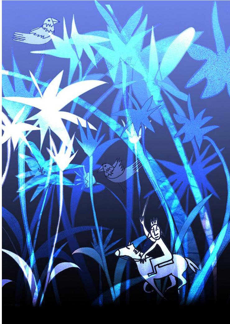
Fig.6 Shot Compositions