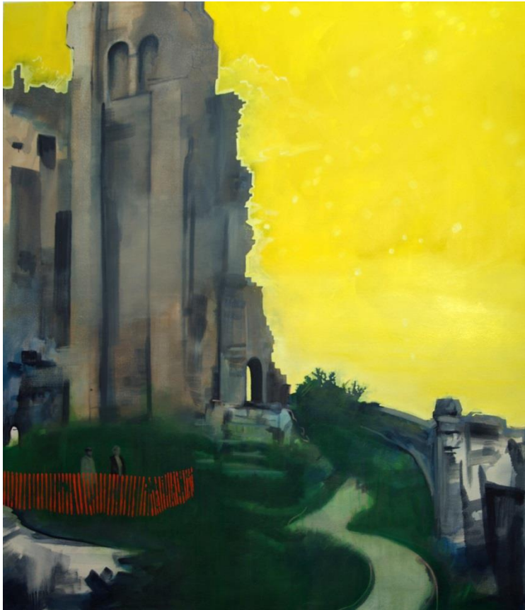
Figure 1: Craig Barber, The Waiting game . 2008. Oil on canvas, 120 x 103 cm.