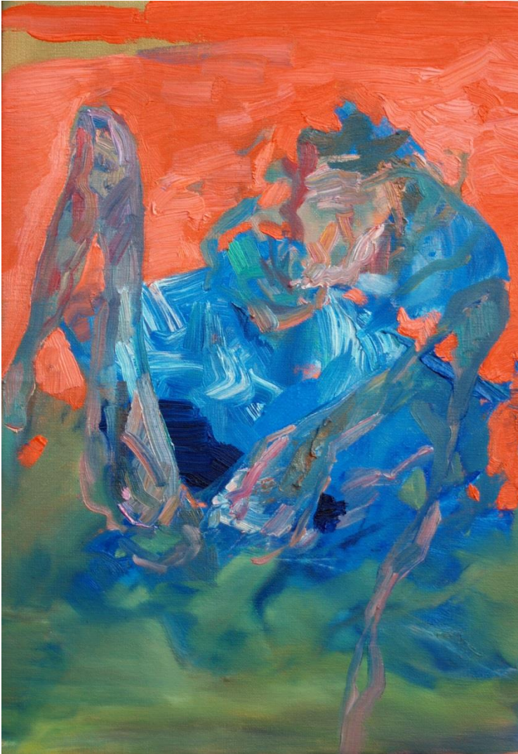
Figure 2: Craig Barber, Gerty . 2013. Oil on canvas, 36 x 25 cm.