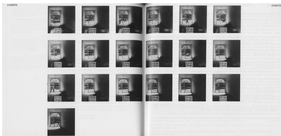
Figure 2 Jan Dibbets, The Shadows at Konrad Fischer Gallery , 1969 in Konzeption/Conception , exhibition catalog (Leverkusen: Städtisches Museum, 1969), n.p.

the outside world. A sense of the everyday prevails throughout Dibbets' work; any person working in a given space (studio, office, domestic space) 27 for a period of an afternoon or a day will note how the windows in that space frame the changing strength and orientation of the sun, creating a natural marker of passing time.